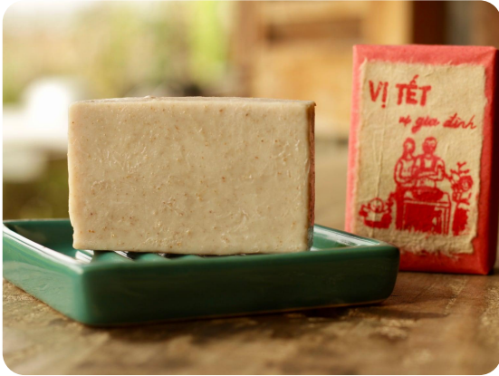
Use waste oil to make soap