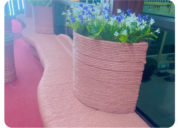
3D printing concrete from thermal power plant waste