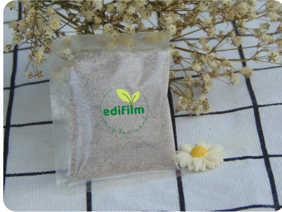
Edible food wrap